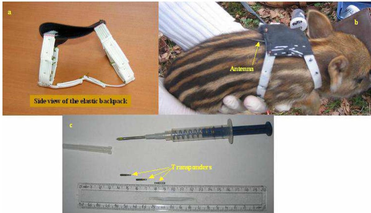
Figure 2. a) Harness system designed to fit out piglets with a backpack. Note that on the white elastic belts of the harness, sewing points are visible. The harness can thus adjust to the piglet during its body growth until the next recapture event. b) Piglet fitted out with a backpack. The pocket of the backpack was clipped once the transmitter was put inside. The antenna was directed toward the back of the piglet. c) Transponders and the applicator used to inject into the subcutaneous tissue. The ruler indicates the size of transponders (cm)